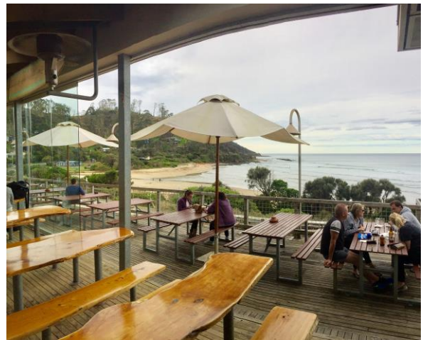
Magic views from the Wye Beach Hotel today!!

The Bureau of Metrology is predicted severe weather for Wednesday and Thursday this week, involving thunderstorms, heavy rain, high winds, with a storm surge on Friday.